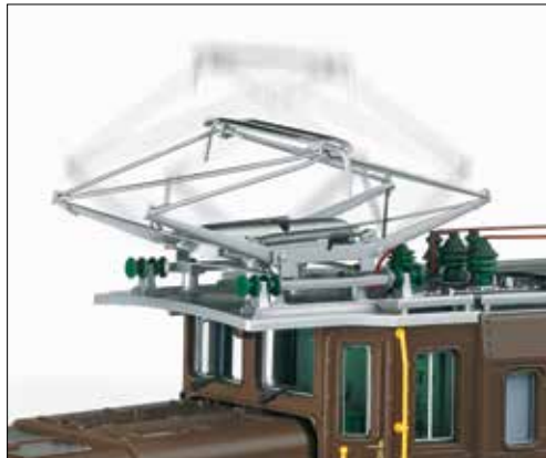
Pantographs can be raised and lowered by a motor