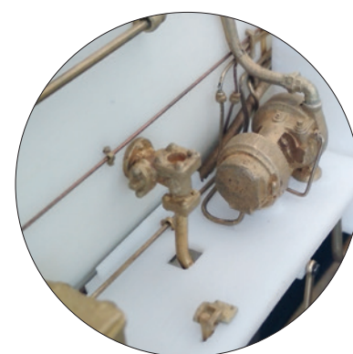
Constructed with a high level of precision: feed water valve and generator