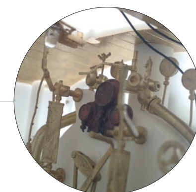
Realized with a high level of detailing: the firebox wall in the cab

Running sounds also work in analog operation Steam exhaust at the vacuum brakes and whistle as well as cylinder steam and steam exhaust synchronized to the wheels (first use of 4-way smoke units at the Märklin Company)