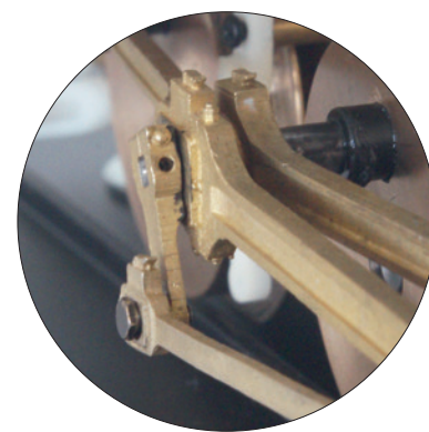
Synchronized with the wheels: Drive rod on the driving wheel

Running sounds also work in analog operation Steam exhaust at the vacuum brakes and whistle as well as cylinder steam and steam exhaust synchronized to the wheels (first use of 4-way smoke units at the Märklin Company)